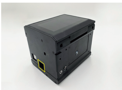
0.5" Single guide plate