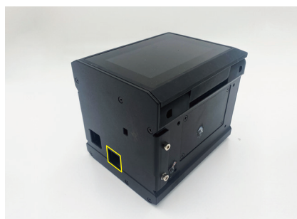
0.5" Stitch guide plate