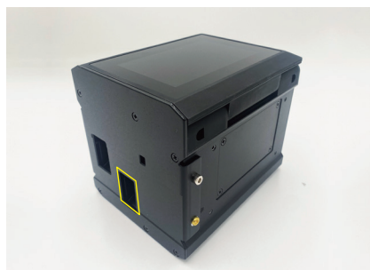
1" Stitch guide plate